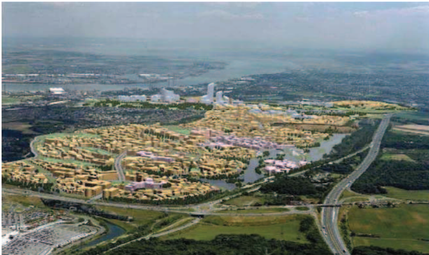
Thames Gateway - Kent

Whilst there is no doubt that international and global forces will shape the future of the Kent economy, we believe that this reinforces the need to act locally to support businesses and to help set the right conditions for economic growth. This Framework sets out some of the contributions that we intend to make to achieve this goal.