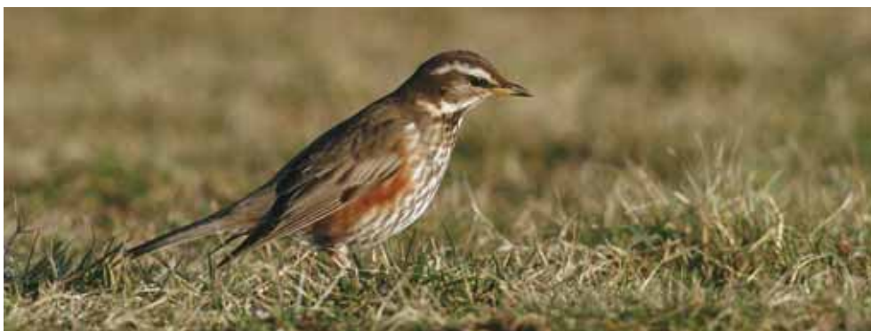
Chris Gomersall (rspb-images.com)

173. Six of the newly Red-listed species in BoCC3 are rare or scarce breeders in the UK, and at the southern or western limit of their breeding range. The Redwing Turdus iliacus is one of these, and the nominate race (shown here, and which breeds in Britain) is Red-listed. The Icelandic race, T. i. coburni , which is a regular passage and winter visitor, is not threatened and was Green-listed in the race assessment (tables 13 & 14).