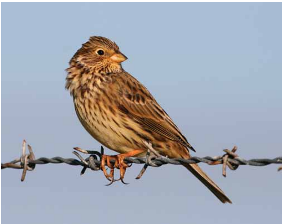
Tom Marshall (rspb-images.com)

167. The Corn Bunting Emberiza calandra has been Red-listed by all three BoCC reviews, and it is one of the signal species of farmland bird declines. It is one of 15 species that have declined by over 80% during the period considered by this review, and remains an urgent conservation priority.