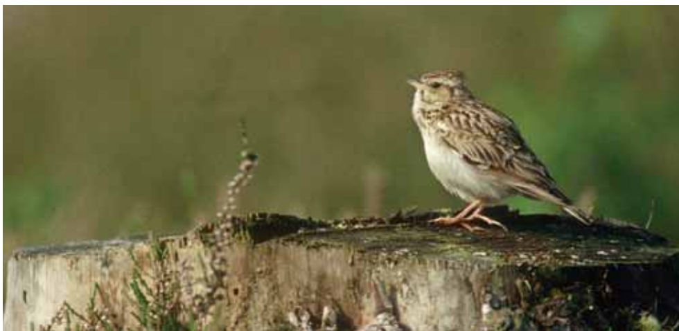
172. An increase in the species' breeding range in the UK has enabled the Wood Lark Lullula arborea to move from the Red to the Amber list between BoCC2 and BoCC3.