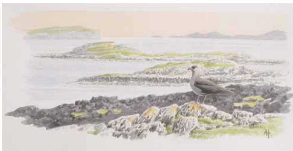
Arctic Skua Stercorarius parasiticus